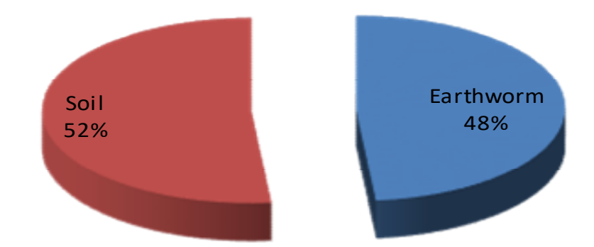
Figure 3: shows the percentage concentration of Benzene compound analysed in the soil and earthworm

From the pie chart, (figure 3), the percentage concentration of Benzene compound analysed in the soil and earthworm was at 52% for soil while 48% was recorded for earthworms. Although BTEX are known to vapourize in contaminated sites, they can remain locked in soil for months and even years as reported by the United Nations Environment Program assessment in Ogoni land (UNEP 2011), hence they need special attention in crude oil-contaminated soil. Each of these compounds or their combination poses a serious concern to human health, living organisms and the environment. Benzene is a notorious cause of bone marrow failure. Substantial quantities of epidemiologic, clinical, and laboratory data link benzene to aplastic anemia, acute leukemia, and bone marrow abnormalities (Kasper et al. 2004) and myelodysplastic syndrome. Human exposure to benzene is a global health problem. Animal studies have reported effects on the blood, liver, and kidneys from chronic inhalation exposure to ethylbenzene (Bayssant et al. , 2001).